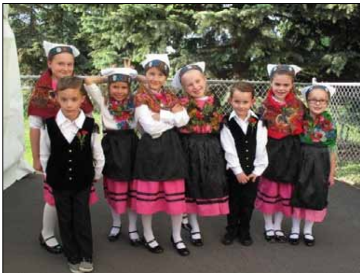
Childrens Dance Group

A lot of work, preparation and organization went into the 50th celebration. The Children's Dance Group from Calgary as well as the Slovenian Choir started practicing at the beginning of the year. It is our hope and wish that both groups will continue to entertain us on different occasions for many more years to come. As for Ensemble POGUM, they are releasing a new video 'Lahko noč prijatelji' promoting Calgary as well as different parts of Alberta.